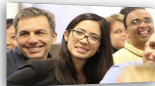
Network with your peers offline and online