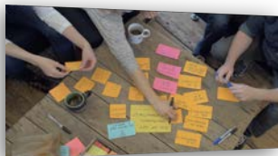
Exclusive discounts on IDEO U courses