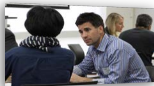
Get help finding providers and partners