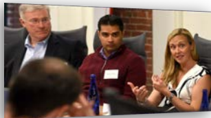
Benefit from custom briefings and advice