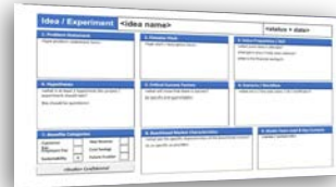
Save time with our tools and templates