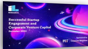
Optimize your approach with reports, assessments